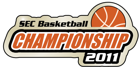
SEC Basketball Championship Saturday June 25 at 9 p.m.

Hawthorne High Gym 21403 S.E. 69th Avenue, Hawthorne Florida 32640