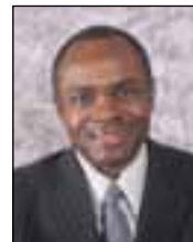
Caesar Robinson Youth Ministries, Pathfinders & National Service Organization