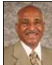
Theus Young Publishing, Family Health & Education Services