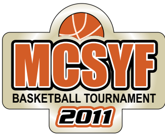
MCSYF Basketball Championship Saturday June 18 at 9 p.m.